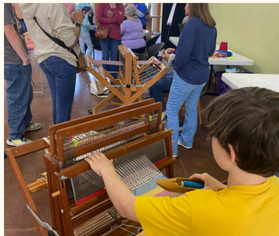
A young visitor learns to weave at CWSG's 2025 Sheep to Shawl. We had a steady stream of kids and a few adults trying weaving for the first time. All were enthusiastic newbies!